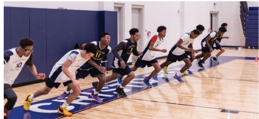
Blue Pride Boys Basketball team practicing in the new Essent Gymnasium

Our athletic facilities (gym, field, fitness center, dance and yoga studio) enable fitness programs for our students and also, for our Tioga neighbors. We have hired more coaches and will offer our students more competitive sports teams and intramurals.